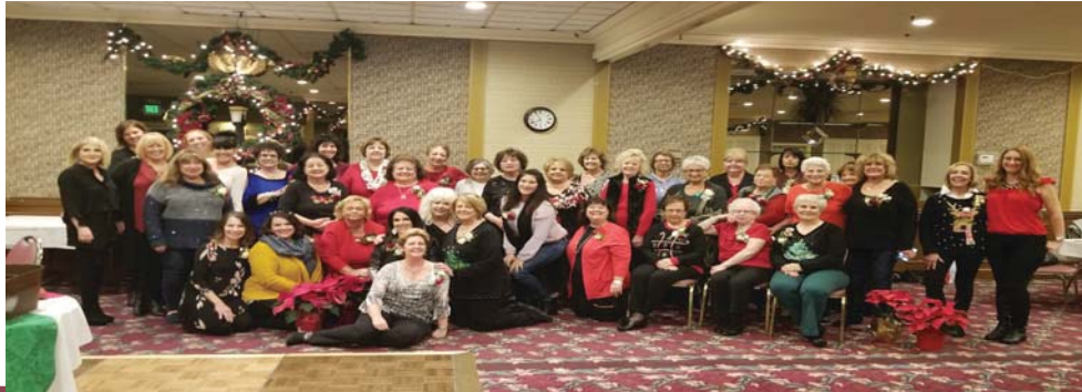
Sons of Sicily Women's Club Christmas Party